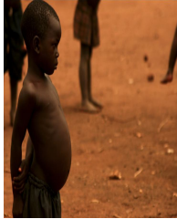
Fig 1. Health condition

Goals (MDGs) emphasize on health which consists decrease in young child mortality, improved maternal health conditions (Sehgal, 2019).