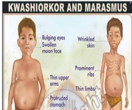
Fig 3.Immunological defects

worldwide fifty-two million young children underneath 5 years of age are wasted, 17 million are severely wasted and one hundred fifty five million are stunted. Around 45% of deaths amongst children under-5 years of age are linked to undernutrition. According to National Family Health Survey (NFHS) – 4, under-5 mortality in India is 50 per one thousand proceed to be births, 38.4% youthful adults below 5 years of age are stunted, 21% are wasted, 7.5% are severely wasted and 35.7% are underweight (Mittal, 2017).