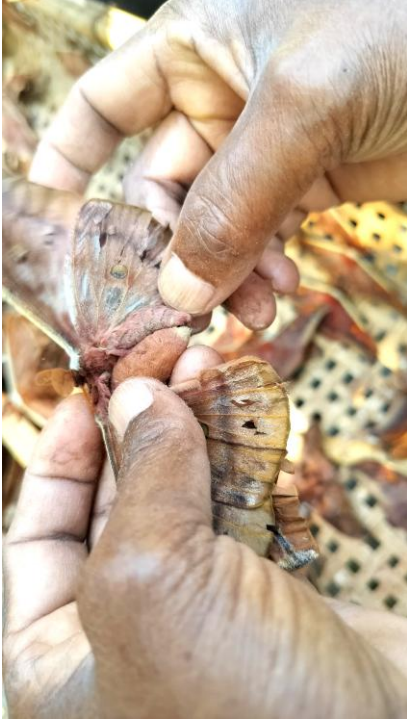
Plate.2: Showing procedure of mechanical mating in Muga silkworm couples