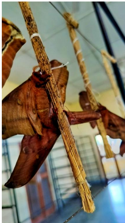
Plate.1: Showing females tied to Kharika with the help of cotton thread