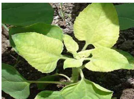
Fig 2: Effect of sulphur in oilseed crops

Source: agritech.tnau.ac.in/agriculture/plant_nutri/sul.html