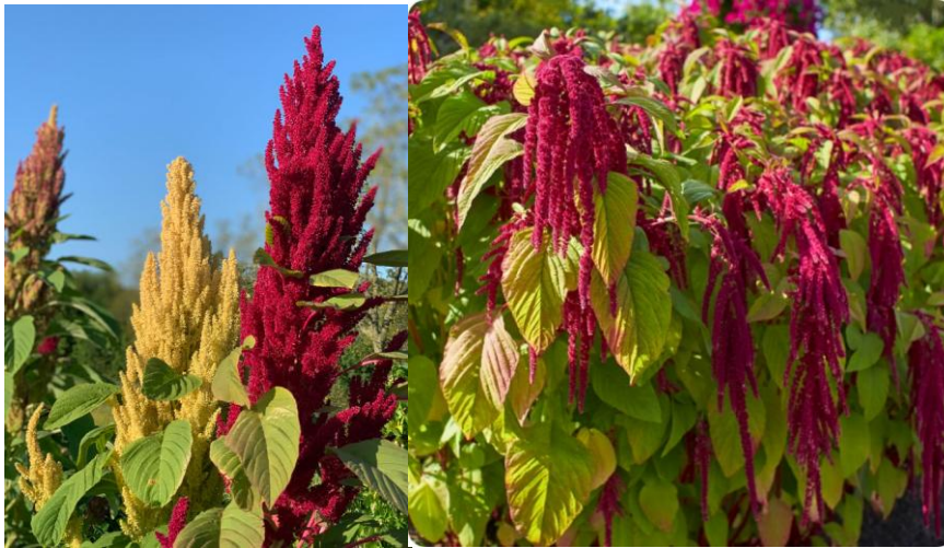
Figure 1. Amaranth field

Furthermore, several items derived from amaranth grains have gained popularity in the market (Mlakar et al. , 2009). Amaranth, a dicotyledonous plant, serves as an illustrative case that employs the C4 pathway for the process of photosynthesis. Consequently, it has potential as a model plant for genetic control investigations pertaining to photosynthesis (Joshi et al. , 2018). This particular organism is classified as a saprophytic halophyte and has a high tolerance to salt, making it well-suited for subsistence agriculture (Barba et al. , 2009).