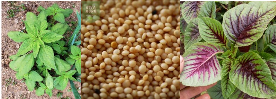
Figure 7 . Leaves and seeds of Amaranth