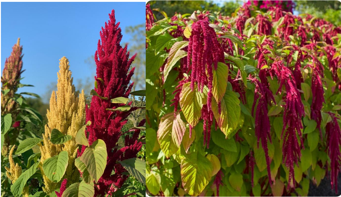
Figure 1. Amaranta field

an appropriate choice for cancer patients. These leaves inhibit the aberrant proliferation of cancer cells in the liver, breast, and colon (Hongyan et al., 2015).