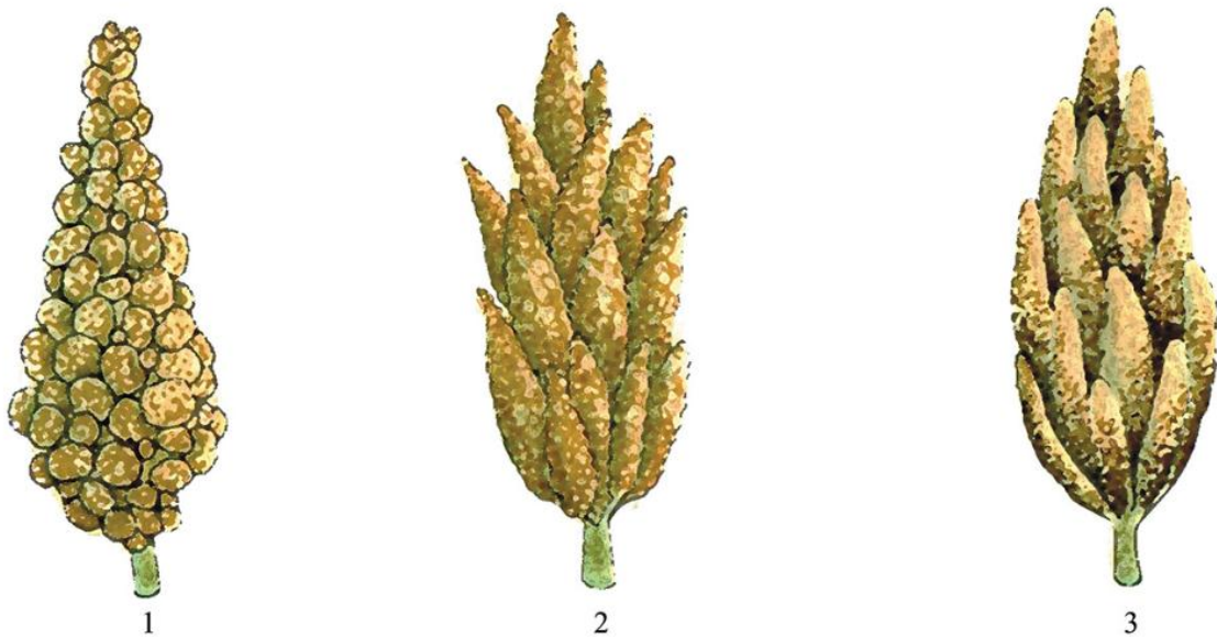
Figure 5. Quinoa panicle morphologies include (1) glomerulated, (2) intermediate, and (3) amaranthiform.

The height of quinoa may exceed two meters, while its panicle-shaped inflorescences exhibit a diverse range of colors, spanning from yellow to purple. There are two distinct forms of panicles, which may be distinguished based on the shape and insertion of the glomeruli. Glomerulated glomeruli are characterized by their spherical shape and originate from tertiary axis, whereas amaranthiform glomeruli are characterized by their elongated shape and originate from secondary axis ( see Figure 5 ). There are instances when the plant exhibits both traits simultaneously, resulting in the formation of an intermediate inflorescence (Rojas and Pinto 2013).