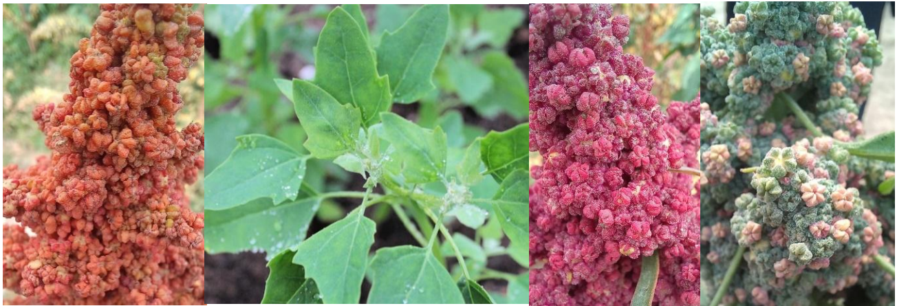
Figure 3. Quinoa leaf and different varieties of quinoa

Quinoa is classified as a dicotyledonous annual plant that falls under the botanical family Amaranthaceae. The plant thrives in India, exhibiting several cultivars that reach a height of 1.5 m, possess numerous branches, and has a substantial leaf size (Tapia, 2000). The presence of unisexual female flowers is a notable attribute of quinoa, as seen in Figure 3 . Quinoa exhibits three distinct panical shapes, namely amarantiform, intermediate, and glomerulate. The secondary axis gives rise to elongated glomeruli in amarantiform panicles, while the tertiary axis develops spherical glomeruli. In certain instances, a plant may exhibit both amarantiform and intermediate panical shapes, resulting in the formation of an intermediate inflorescence (Rojas et al., 2013).