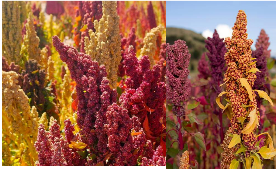
Figure 2. Quinoa plants