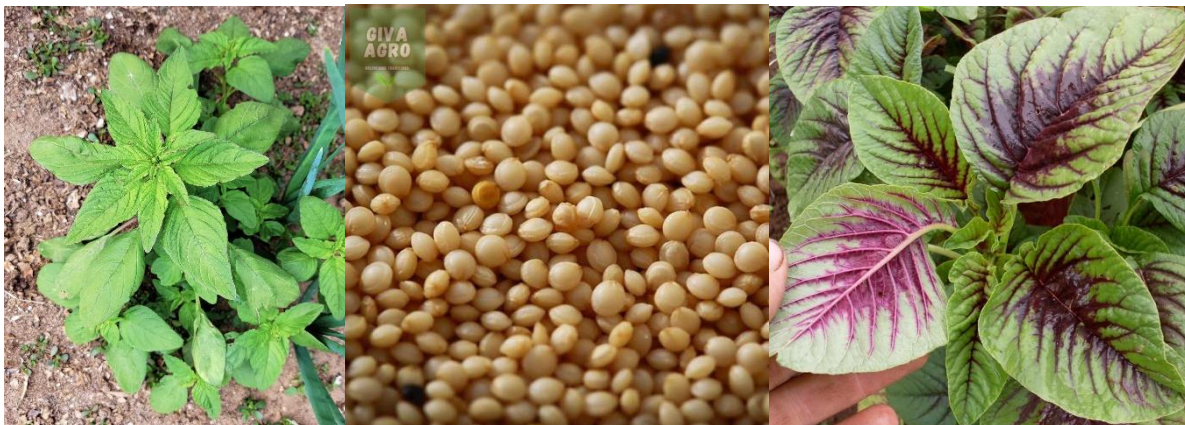
Figure 7 . Leaves and seeds of Amaranth

Amaranth displays a range of ploidy levels, and the analysis of pollen grain characteristics enables the identification of interspecific hybrids. Pollen grains of dioecious plants has several pores on their surface. According to the ploidy level of the plant, the size of pollen grains is contingent upon. A lower ploidy level is associated with a smaller size, whereas an increase in ploidy level is associated with a rise in size. Polyploids have a greater number of patterns in the exine compared to diploids (Franssen et al., 2001).