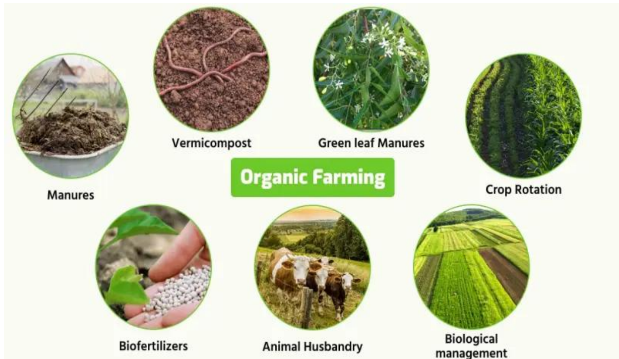
Fig 2. Application of organic farming

matter and additional nitrogen. Commonly used green manure crops are such as Sun hemp ( Crotalaria juncea ), Dhaincha ( Sesbania aculeata ), Cowpea, Cluster Bean, Senji ( Melilotus parviflor , Vigna sinensis ), Berseem ( Trifolium alexandrium ) etc. Olle, 2019 [18].