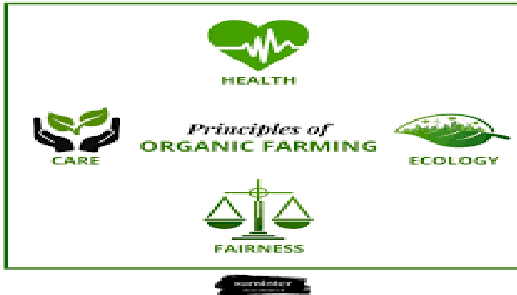
Fig 1. Principles of organic farming (Source: https://statistics.fibl.org/data.html )