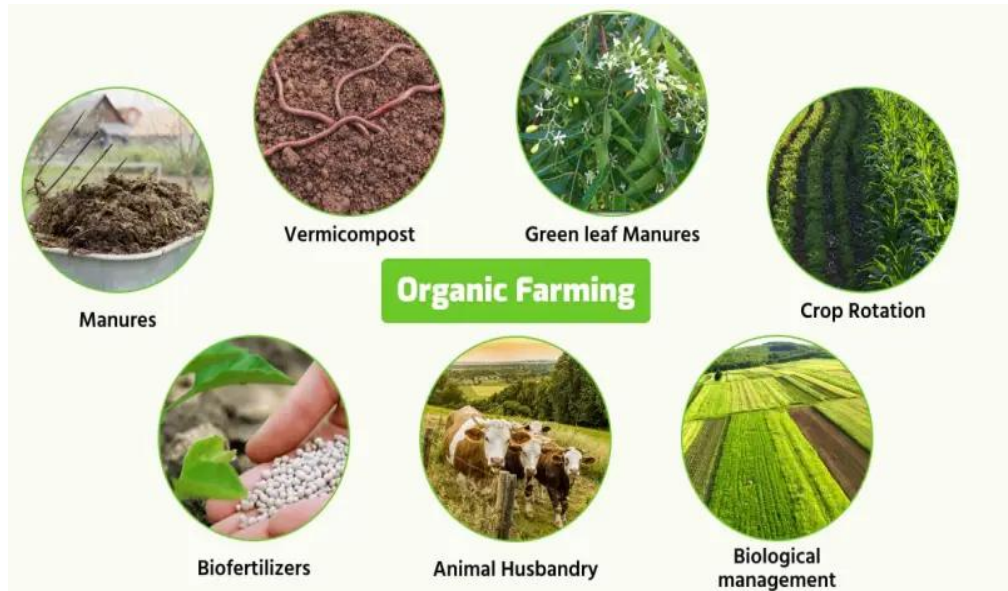
Fig 2. Application of organic farming

structure and fertility of the soil. The green manure crop (legume crop) supplies organic matter and additional nitrogen. Commonly used green manure crops are such as Sun hemp ( Crotalaria juncea ), Dhaincha ( Sesbania aculeata ), Cowpea, Cluster Bean, Senji ( Melilotus parviflor , Vigna sinensis ), Berseem ( Trifolium alexandrium ) etc. Olle,2019 [18].