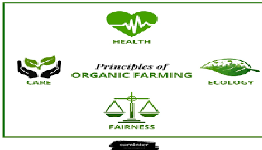
Fig 1. Principles of organic farming