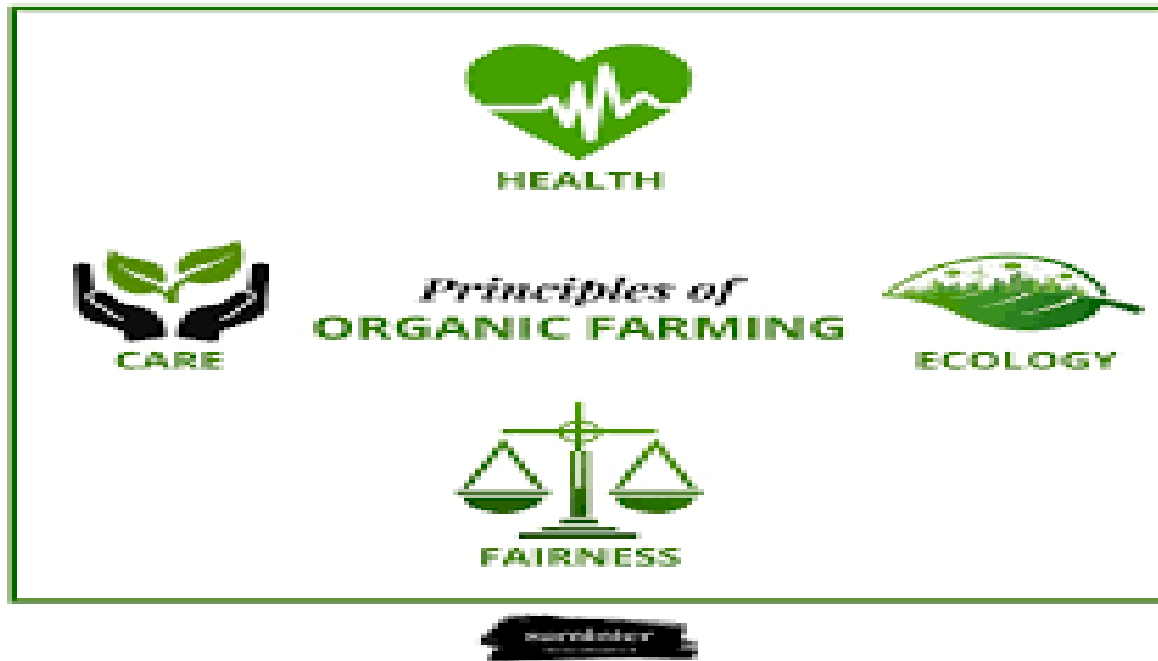
Fig 1. Principles of organic farming