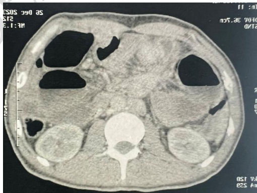
Fig 1: Emergency abdominal CT scan

A 43-year-old patient was admitted to the emergency department for obstructive syndrome without vomiting, evolving in a context of general deterioration with a weight loss of 20 kg over 9 months and asthenia. Patient was conscious, oriented and hemodynamically stable. Clinical examination revealed a conscious patient, stable hemodynamically and respiratory. Abdominal examination showed diffuse tenderness on palpation without abdominal distension or palpable mass with exaggerated bowel sounds. The rest of the clinical examination was unremarkable, and the laboratory tests were normal. Abdominal CT scan revealed small bowel obstruction upstream due to of a non-complicated small bowel intussusception with circumferential and regular wall thickening suggestive of inflammation (Figure 1)