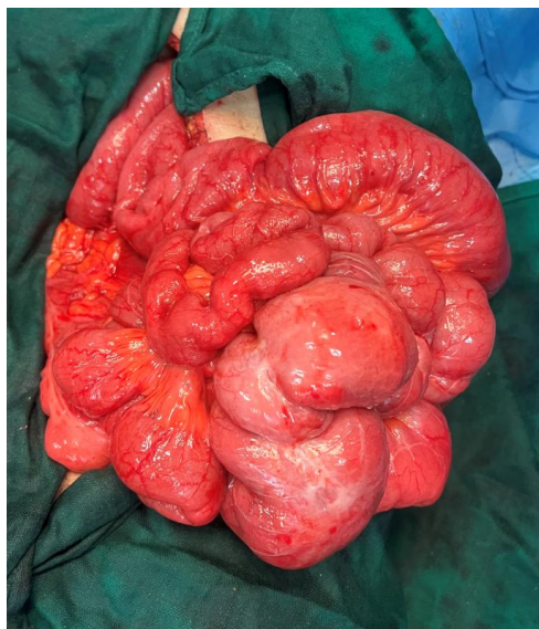
Fig 2: Intraoperative appearance

After consultation with a resuscitation specialist, the patient was transferred to the operating room for an open laparotomy. Exploration revealed a large mass involving the small intestine 5 centimeters from the ileocecal valve associated with upstream small bowel distension and presence of two suspicious hepatic nodules (Figure 2).