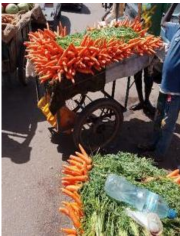
D: street seller of carrot at market 2