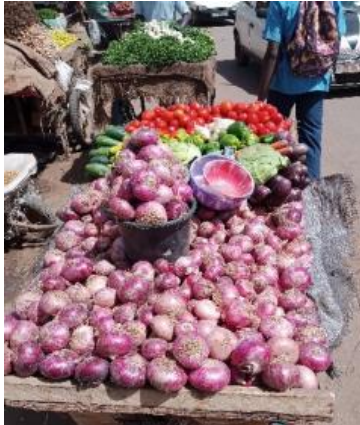
A: street seller of vegetable at market 1