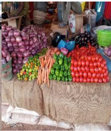
B: retailer seller of vegetable at market 3