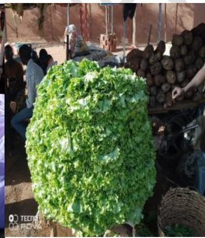
F: seller of lettuce at market 2