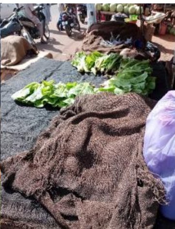
E: seller of lettuce at market 5