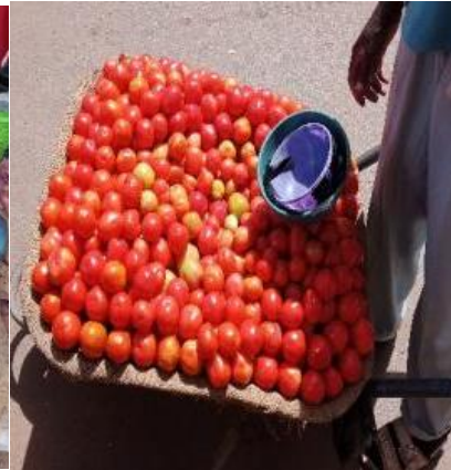
C: street seller of carrot at market 1