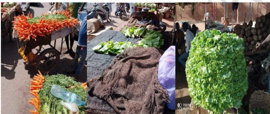
D: street seller of carrot at market 2