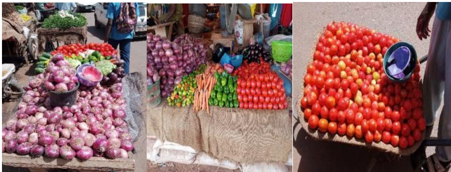
A: street seller of vegetable at market 1