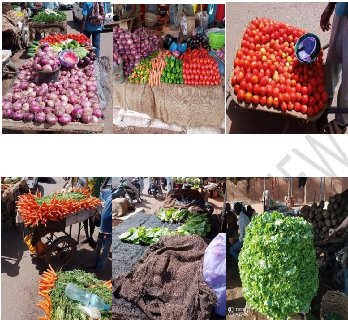
Figure 2 (A, B, C, C, E et F): some vegetables sellers at their site of sale (market)