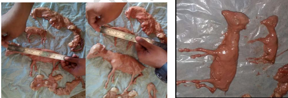
Fig-7: Hematinic mummified large male and small female fetuses layered with chocolate gummy tenacious exudates with placenta.

Comment [A27]: Treatment given seems to be only symptomatic rather based on principles.