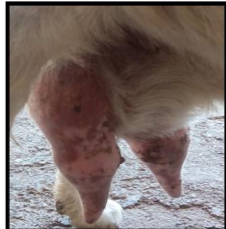
Fig 2: Mammary glands fully engorged with milk