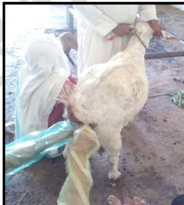
Fig-6: Manually delivered dead mummified fetuses with mild extraction