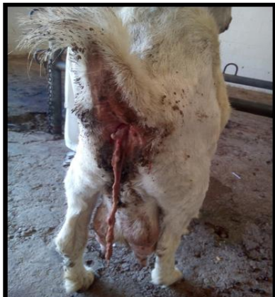
Fig-5: Feto-placental membrane was hanging out

Then the goat was medicated with intramuscularly administration of 3ml-Chlorpheniramine maleate ® (Antihistamines), 5ml-Vitamin B-complex Injection, Melonex ® (Meloxicam-Intas, India) @ 0.5mg/kg. b.wt. IM OD and Quintas ® (Enrofloxacin-Intas, India) @ 5mg/kg. B.wt. IM OD; whereas 500ml Dextrose normal saline was given intravenously with placement of two Furea bolus (control the uterine infection- Allopathic remedies, India) in the uterus. The Liquid Exapar ® (Indigenous herbal uterine cleanser and restorative-Natural Remedies, India) @ 20 ml twice PO and liquid Gluca-boost (To maintain the energy/glucose-Natural Remedies, India) @ 30ml twice PO. Intramuscularly antibiotic, analgesic and antihistamine treatment was continued for 5 days.