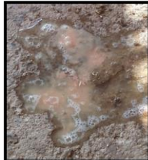
Fig 3: Reddish chocolate coloured discharged was observed

Clinical examination revealed pinkish conjunctival and vaginal mucous membranes, engorged mammary gland (Fig-2), tinged vulval lips with abnormal pinkish to reddish coloured discharge (Fig-3). Abdominal ballottement revealed that hard freely movable mass suggesting the presence of fetus, which was further, confirmed by real time B mode transabdominal ultrasonography (Sonosite, Titan Ltd. Hitchin, United Kingdom). Two hyperechoic striations of thoracic cage without cardiac motility and lack of fetal fluid indicated the presence of mummified fetuses (Fig-4). The pervaginal examination with proper lubrication revealed empty birth canal with only one finger dilated cervix. Based on the history, a clinical signs, ultrasonographical and pervaginal examination the case was diagnosed as a dystocia due to incomplete cervical dilatation with twin mummified fetuses.