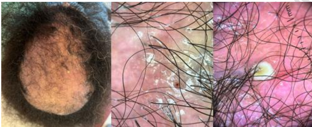
Fig 3: patch of cicatricial alopecia on the scalp with trichoscopy images

Dermatological examination showed a wide patch of cicatricial alopecia on the scalp, measuring 15 x20 cm; pull test hair was negative. Trichoscopy revealed loss of partial follicular opening, follicles surrounded by milky red areas, dilated blood vessels, pustules, and follicular tufts. Fig 3