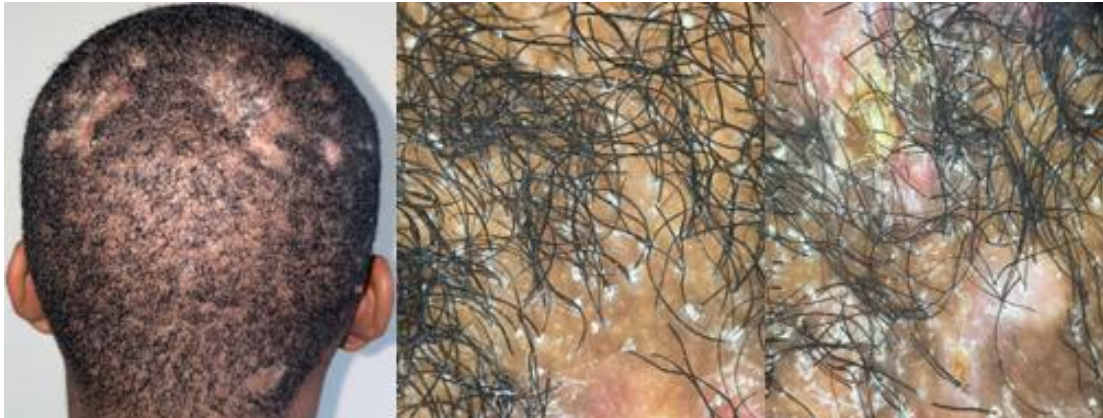
Fig 5: scarring patches of alopecia on the scalp with trichoscopy images

Case 3: A 20-year-old male was treated for 8 years for pilar lichen with corticosteroids, he presented with scarring patches of alopecia, pustules, and crusts on her scalp, and the hair pull test was negative. Trichoscopy showed hyperkeratosis and erythema, tubular hair casts, milky red areas, and tufts (fig5).