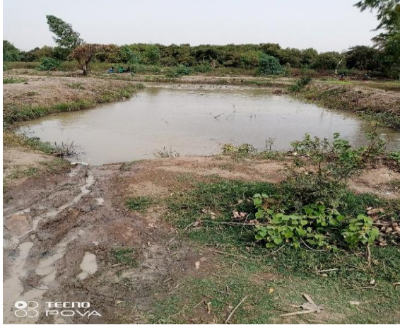
a: watering water source1