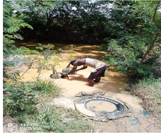
b: watering water source 2