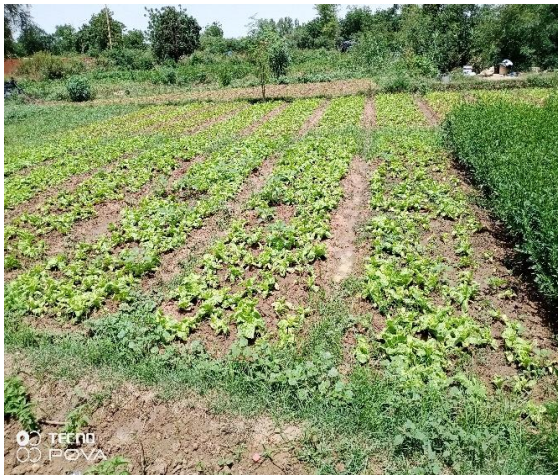
c : field of lettuce