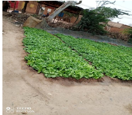
d lettuce dishes