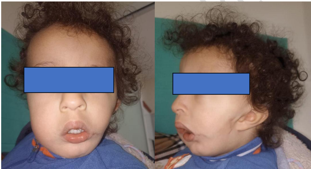
Figure 6: appearance of the patient 6 months postoperatively.

The clinical results at 6 months postoperatively were satisfactory, the patient has an oral cleft of normal size, good lip continence and the surgical scar is linear and barely visible.