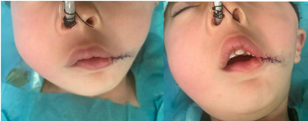
Figure 5: photo of the patient immediately post-operatively on the operating table.

Note that in this patient, we took advantage of the fact that he was under general anesthesia for the excision of the left pre-auricular fibrocartilaginous lesion process. The postoperative course was simple without local signs of infection or discharge.