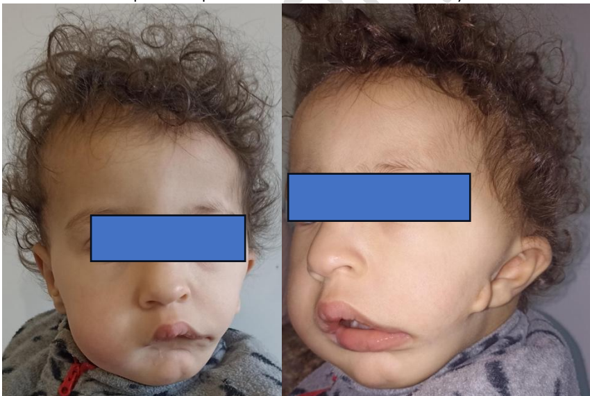
Figure 2: photos of the patient showing the malformations of cleft 7

So in total our patient presents an otomandibular syndrome.