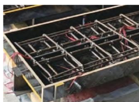
(a) Steel-concrete combination beams-PBL

The PBL connector is a new shear-resistant connector proposed by Leonhardt and Partners[4] in Germany to solve the potential fatigue problems associated with traditional weld-nail connectors. After more than three decades of development, PBL connectors have been widely used in actual bridge projects. Unlike traditional welded nail connectors that resist shear on one side, PBL works along both sides of the open plate and has a relatively higher shear load capacity. For steel-concrete composite structural girder bridges, the open steel plates of the PBL connectors are welded to the steel girder flanges by longitudinal fillet welds, which also have less impact on the steel girders due to the smaller size of the weld foot of the fillet welds as compared to the weld nails of the section fusion welds as shown in Fig. 1(a). For steel-concrete hybrid girder bridges, its combined section is generally constructed with lattice chambers, in which vertical partitions are perforated and penetrated with reinforcing bars to form PBL connectors with the infilled concrete for load transfer.