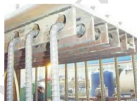
(b) Steel-concrete bonding section-PBL