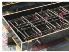
(a) Steel-concrete combination beams-PBL

higher shear load capacity. For steel-concrete composite structural girder bridges, the open steel plates of the PBL connectors are welded to the steel girder flanges by longitudinal fillet welds, which also have less impact on the steel girders due to the smaller size of the welding foot of the fillet welds as compared to the weld nails of the section fusion welds as shown in Fig. 1(a). For steel-concrete hybrid girder bridges, its combined section is generally constructed with lattice chambers, in which vertical partitions are perforated and penetrated with reinforcing bars to form PBL connectors with the infilled concrete for load transfer.