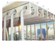
(b) Steel-concrete bonding section-PBL