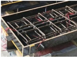
(a) Steel-concrete combination beams-PBL

The PBL connector is a new shear-resistant connector proposed by Leonhardt and Partners[4] in Germany to solve the potential fatigue problems associated with traditional weld-nail connectors. After more than three decades of development, PBL connectors have been widely used in actual bridge projects. Unlike traditional welded nail connectors that resist shear on one side, PBL works along both sides of the open plate and has a relatively higher shear load capacity. For steel-concrete composite structural girder bridges, the open steel plates of the PBL connectors are welded to the steel girder flanges by longitudinal fillet welds, which also have less impact on the steel girders due to the smaller size of the weld foot of the fillet welds as compared to the weld nails of the section fusion welds as shown in Fig. 1(a). For steel-concrete hybrid girder bridges, its combined section is generally constructed with lattice chambers, in which vertical partitions are perforated and penetrated with reinforcing bars to form PBL connectors with the infilled concrete for load transfer.