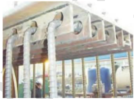
(b) Steel-concrete bonding section-PBL