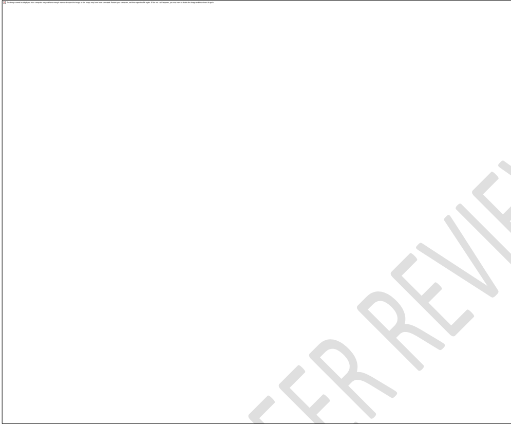
Figure 3: X-Ray Flexion Extension of the same patient showing significant anterolisthesis of L5 over S1 vertebra