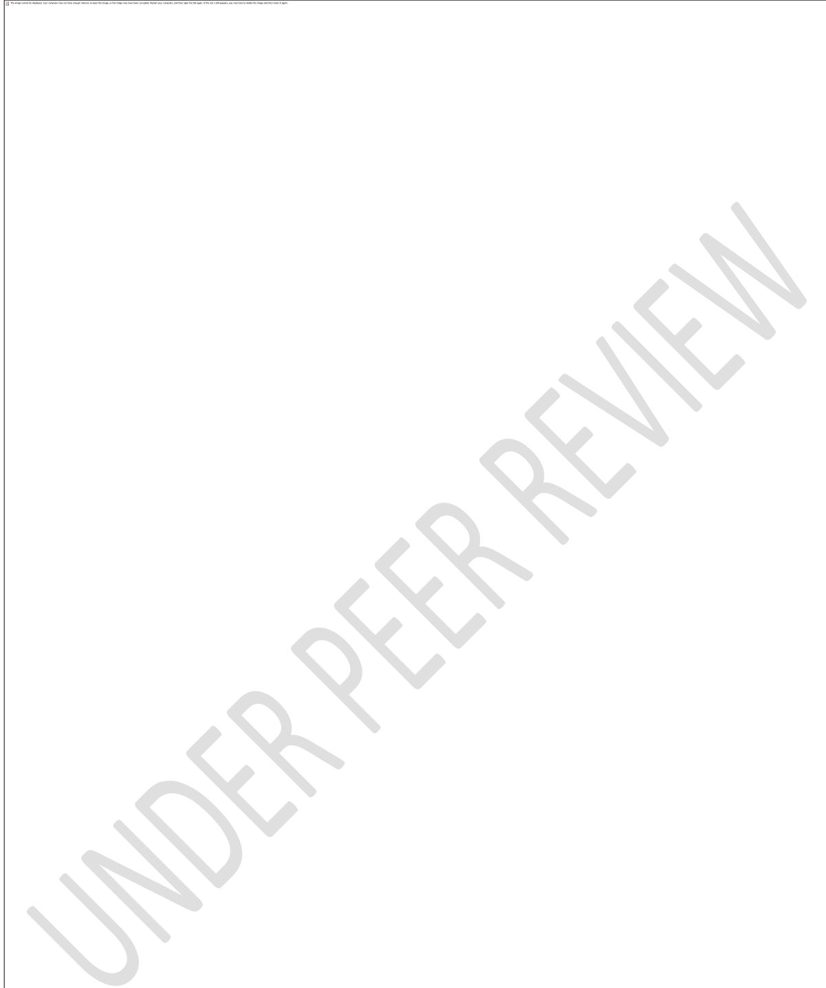
Figure 2: MRI Lumbosacral Spine T2- weighted image of the patient showing presence of significant fluid in facet joints at L5-S1 level on axial cuts with abnormal facet fluid marked with yellow arrows but no abnormality in alignment at L5-S1 level on supine sagittal view of MRI.