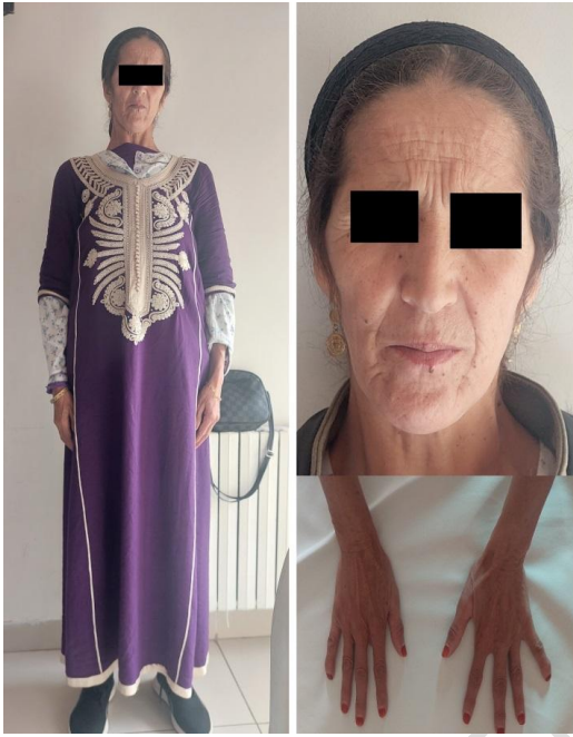
Fig. 1. Image showing the The main clinical signs that may point to Marfan syndrome : a suggestive morphotype (large size with a lanky morphotype) and arachnodactyly.

Ophthalmological examination revealed a distance visual acuity limited to counting fingers in both eyes, the automated refraction was not obtainable. Ocular pressure was within normal range. Examination of the anterior segment showed clear corneas, iridodonesis, and ectopic opaque crystalline lenses bilaterally. Fundus revealed multiple drusens scattered throughout the retina, reduced macular reflex, and chorio-retinal atrophy (fig.2).