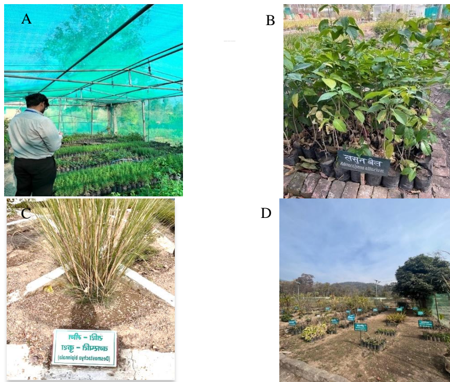
Fig 1:Data collection (A) Documentation of species process (B) Allium Sativum with sign board (C) Desmostachyabipinnata with sign board (D) Herbs with sign board

A preliminary survey was conducted in the study area to determine the objective, which is the scientific documentation of medicinal plants. Signboards were utilized to enlist most of the species. Later on, information about each species such as habit, family, conservation status and medicinal uses were enlisted through online resources such as IUCN, the Botanical Survey of India Medicinal plant database and Plants of the World Online Kews Gardens. These sources were used to ensure the standardization of data Later on, the data had been analysed in Microsoft excel.