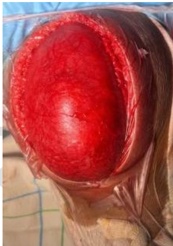
Fig. 3. Intraoperative view showing the longitudinal incision along the thigh.

Immediate excision of the tumor was indicated. The patient underwent general anesthesia; a posterior approach to the thigh with longitudinal incision was done (Fig. 3). The mass was encapsulated and adherent at its superior and inferior poles. The sciatic nerve was distant from the mass. Meticulous dissection was performed, and the mass was removed without any incident.