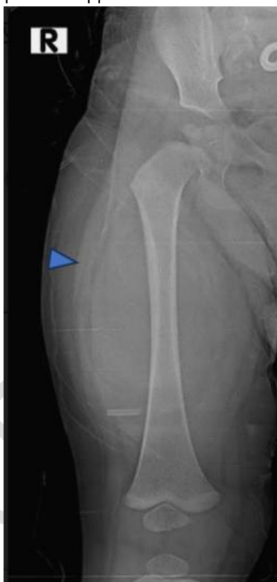
Fig. 1. Femur X-ray showing a large oval opacity with clear and regular contours (blue arrow).

A physical examination revealed a well-developed infant with a large solid, fixed and painful mass on the posterior left thigh, with collateral venous circulation. The Femur X-ray (Fig. 1) showed a large oval opacity with clear and regular contours, occupying almost the entire posterior compartment of the soft tissues of the left thigh without calcifications or bone lesions. The ultra-sound revealed a well-demarcated, oval, hyperechoic formation measuring approximately 6.4x6 cm, traversed by thick hyper-vascularized septa on Doppler.