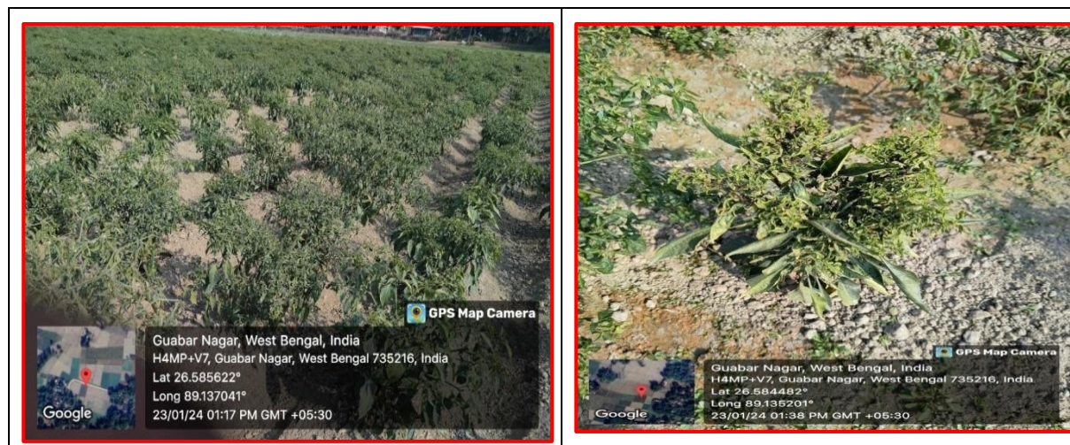
Fig. 1. Infestation of Chilli Thrips ( Thrips parvispinus ) in Guabar Nagar, West Bengal

Very recently, during the month of January, 2024, the invasive thrips T. parvispinus was found to infest chilli crops in farmers' field in the village Guabarnagar under Alipurduar district of West Bengal. Undergraduate students, conducting Rural Agricultural Work Experience (RAWE) under Student READY programme in that village informed about huge crop loss in chilli due to insect infestation.