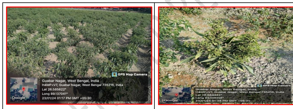
Fig. 1. Infestation of Chilli Thrips ( Thrips parvispinus ) in Guabar Nagar, West Bengal

Following this, survey was conducted and thrips infestation was noticed. Both nymphs and adults were found to congregate on flowers and flower buds. Chilli plants were found to be stunted severely and leaves were curled and crinkled with reduced size. The crop suffered huge flower dropping.