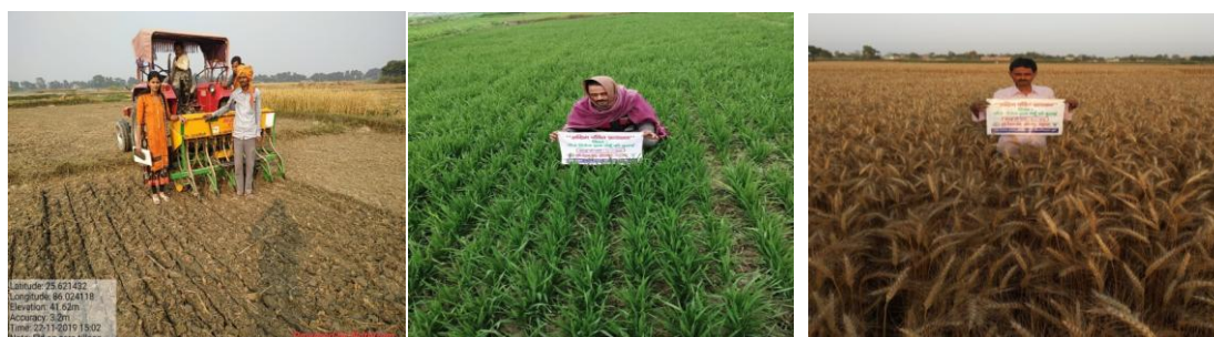
Fig-2 Different stages of ZT wheat at Farmers field

Results of three years Front Line Demonstration were recorded and given in Table-3. As per the observation an average yield was recorded 50.37q/ha of demonstration plot whereas under farmers practice it was recorded 43.13q/ha. These results clearly indicated that the average grain yield of demonstration plot is 16.78 per cent higher than the FP. Meena et al (2016) also observed the higher wheat yield in zero tillage as ZT wheat farmers could sow the crop much earlier than their conventional counterpart and early sowing is associated with higher yield, a significant and positive yield impact (increased by 15.73 %) observed in the study area. Punia et al. (2002) also found the same. The yield of wheat could be increased over the yield obtained under farmer's practices by the use of Zero tillage technique (Prasad et al. 2002).