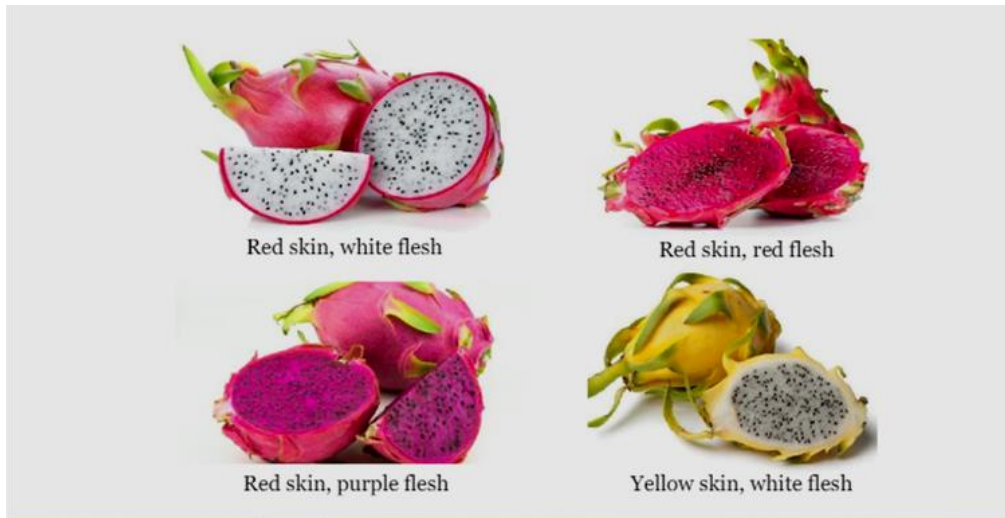
Fig. 1. Species of dragon fruit grown in India Wakchaure et al., 2020

Among these species, Hyloceus spp are diploid in and Selenicereus spp is