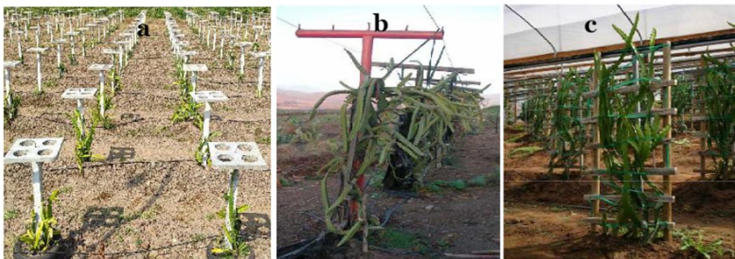
Fig 3. Different trellis systems namely (a) concrete pole and rings (b) T stand and iron wires (C) Wooden ladder for dragon fruit establishment

Continues type G.I. pipe stands and G.I. angles can also be used. This pyramid shape has a length of about 10-15 meters. A greater number of plants could be planted. Adequate aeration was provided to avoid disease and pests attack. Plants should be placed 2-3 feet apart on both sides of the structure. The distance between two structures could be between 5 and 6 meters. Compared to other trellis systems, the single pole system performed better in terms of growth and yield. Although cement poles are expensive, they are long-lasting and can be used.