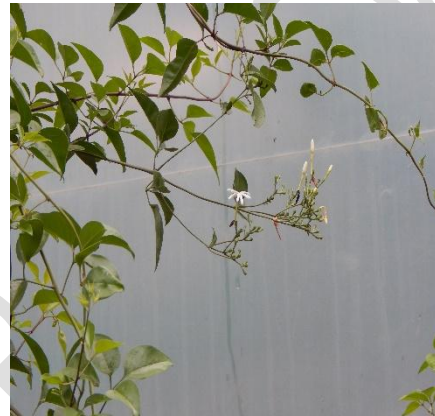
Figure1 : General view of Mysore Mallige ( J. azoricum L)