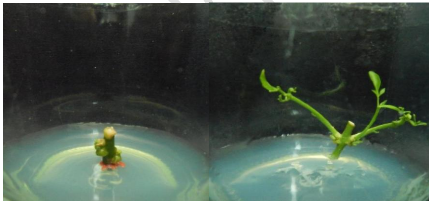
Figure3 :Sprouting of axillary buds from single node cuttings and formation of multiple shoots in J. azoricum L under in vitro condition