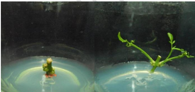
Plate 3: Sprouting of axillary buds from single node cuttings and formation of multiple shoots in J. azoricum L under in vitro condition