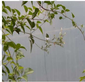
Plate 1 : General view of Mysore Mallige ( J. azoricum L)