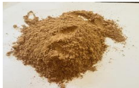
Figure 1b; Cashewnuttesta powder

Cashew nut testa powder was mixed with water in various ratio of powder/water based on weight in four batches (1:6, 1:9, 1:12 and 1:15) and continuously agitated in the reactor maintained at a temperature of 70 °C for 90 minutes. The solutions obtained were cooled for two hours and filtered using a muslin cloth. The pH of the extracted tannin solutions was measured. The extraction process was repeated twice in each ratio and five replicates of sample solution were taken randomly for tannin analysis.