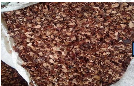
Figure 1a; Cashewnuttesta

Cashew nut testa was shade-dried for three days, followed by grinding using a hammer mill and sieving to obtain a powder with particle size less than 1 mm.