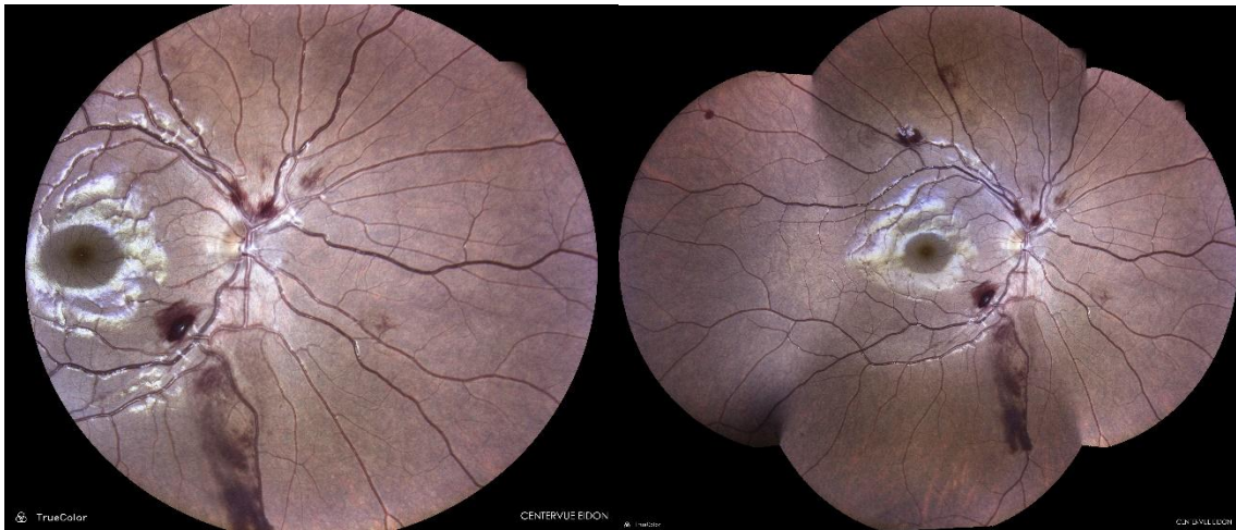
Figure 3. retinography shows multiple well-limited round preretinal hemorrhagic spots located in the posterior pole and periphery of the left eye