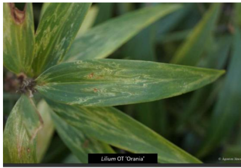
Cucumber mosaic virus – CMV