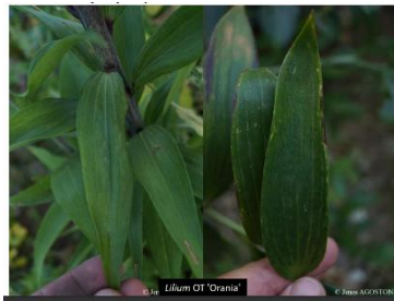
Lily symptomless virus – LSV

Control: use virus-free tissue culture batches or certified batches with a very low disease, spray against vectors according to current advice.