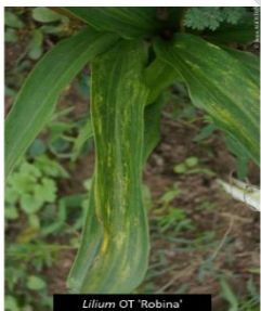
Lily mottle virus – LMoV

Control: culling infected plants; keeping the beds weed free; avoid scaling of batches grown in warm countries or have such batches of susceptible cultivars tested beforehand; spray against vectors according to current advice.