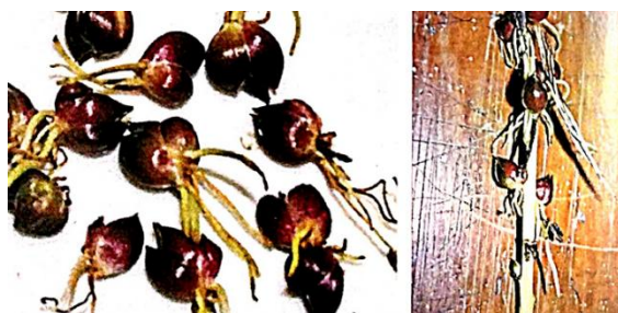
Fig . 1 showing stem detached bulbils (left) and bulbils attached with flowering axis (right)

Bulbils are aerial bulblets produced in the axils of leaves. They are usually dark purple to brown and 1-2 cm long. The capacity to produce bulbils varies with the species. Lilium tigrinum , L. bulbiferum , L. sulphureum and L. sargentae are easy to form bulbils. The production of bulbil can be encouraged by disbudding. The bulbils are harvested after flowering is over. They may have dormancy and planted in late summer.