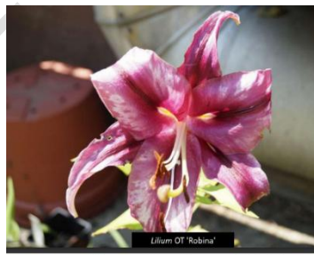
Lily mottle virus – LMoV