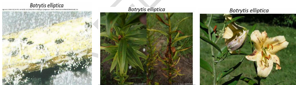
Plate 5 : Botrytis elliptica

Control: do not plant too close, apply good weed control, clean up plant debris and burn them or cover them with at least 30 cm (~ 1 foot) soil to facilitate natural decomposition; spray with Bordeaux mixture or use of a copper and mancozeb based chemical. Switch, Signum, Chorus, Teldor, Folicur, Luna Experience, Amistar Top, Flint Max = Flint Extra, Prosaro are also good.