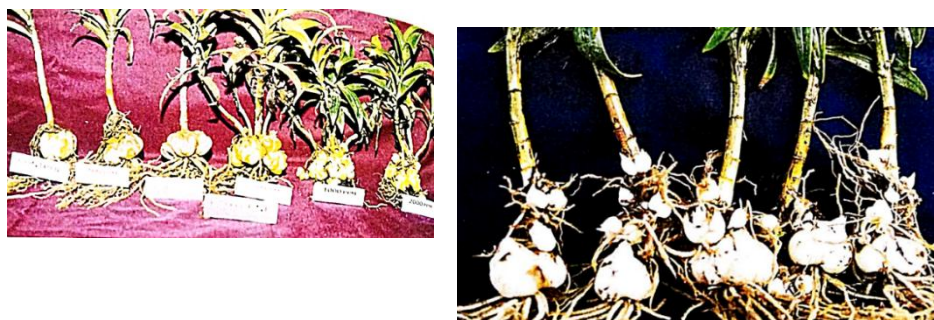
fig . 2 (Showing role of Ethrel in promoting branching bulbing of Lilium longiflorum )

The clean, healthy, disease free bulbs are selected from the mother stock for removal of scales. The scales are detached very carefully in such a way that they retain tissues from the basal plate. The scales broken halfway fail to produce bulblets. The scales may be removed at any time of the year, however, just before planting or after flowering is the best time. The detached scales should washed in running water and soaked in fungicide (Bavistin 1.5 g/l) for 30 minutes. The scales are air dried in a shady place to get away with adhered water.