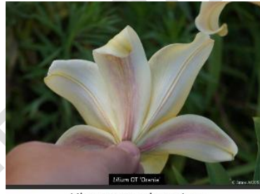
Lily symptomless virus