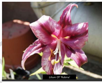
Lily mottle virus – LMoV