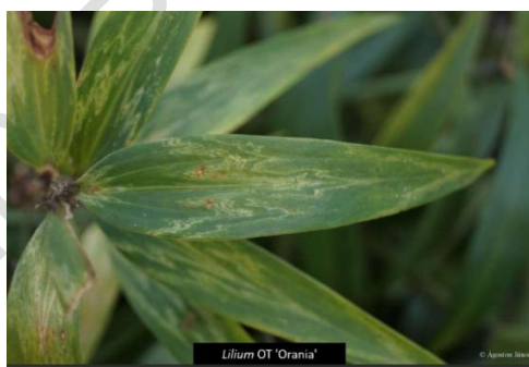
Cucumber mosaic virus – CMV

Symptoms: Light green to yellow stripes, vaguely defined light green spots, angular light and dark green spots, typical oak leaf pattern, but after the flowering period the light green spots and stripes in Longiflorums more often turn into gray necrotic spots, and in Asiatics into brown necrotic spots. The leaf margins are sometimes wavy; in several cultivars the leaves are curled. Flower breaking is more accompanied by flower malformation. The clinical picture is often more severe in the simultaneous presence of the lily symptomless virus, in this case the stripes and spots necrotize. During the growing season in which the infestation occurs, symptoms are usually confined to the top of the plant. Late infections do not become apparent until the following season, usually showing symptoms throughout the plant. A mosaic of veins consisting of sharply defined, light green to yellow veins usually accompanied by a strong curling of the leaves and bud/flower deformity is a typical picture. In maritime and cooler climates the virus is relatively rare in lilies. This is in contrast to warm countries, where it can be a clear problem in susceptible cultivars, such as 'Casa Blanca'. The virus does not pass with the seed in lilies (de Best et al. 2000).