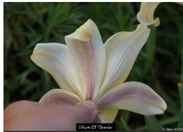
Lily symptomless virus