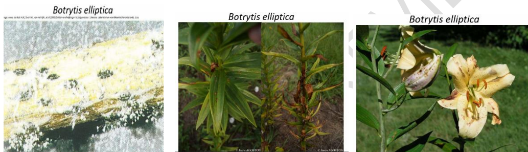
Plate 5 : Botrytis elliptica

Control: do not plant too close, apply good weed control, clean up plant debris and burn them or cover them with at least 30 cm (~ 1 foot) soil to facilitate natural decomposition; spray with Bordeaux mixture or use of a copper and mancozeb based chemical. Switch, Signum, Chorus, Teldor, Folicur, Luna Experience, Amistar Top, Flint Max = Flint Extra, Prosaro are also good.