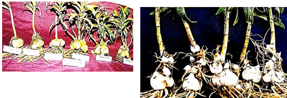
fig . 2 (Showing role of Ethrel in promoting branching bulbing of Lilium longiflorum )

The clean, healthy, disease free bulbs are selected from the mother stock for removal of scales. The scales are detached very carefully in such a way that they retain tissues from the basal plate. The scales broken halfway fail to produce bulblets. The scales may be removed at any time of the year, however, just before planting or after flowering is the best time. The detached scales should washed in running water and soaked in fungicide (Bavistin 1.5 g/l) for 30 minutes. The scales are air dried in a shady place to get away with adhered water.