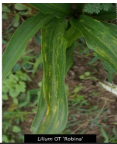
Lily mottle virus – LMoV

Control: culling infected plants; keeping the beds weed free; avoid scaling of batches grown in warm countries or have such batches of susceptible cultivars tested beforehand; spray against vectors according to current advice.