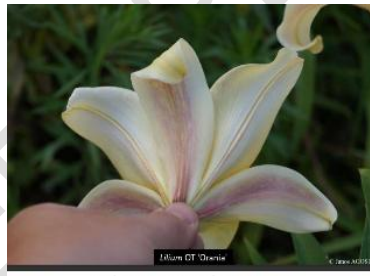
Lily symptomless virus