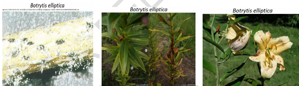
Plate 5 : Botrytis elliptica

Control: do not plant too close, apply good weed control, clean up plant debris and burn them or cover them with at least 30 cm (~ 1 foot) soil to facilitate natural decomposition; spray with Bordeaux mixture or use of a copper and mancozeb based chemical. Switch, Signum, Chorus, Teldor, Folicur, Luna Experience, Amistar Top, Flint Max = Flint Extra, Prosaro are also good.