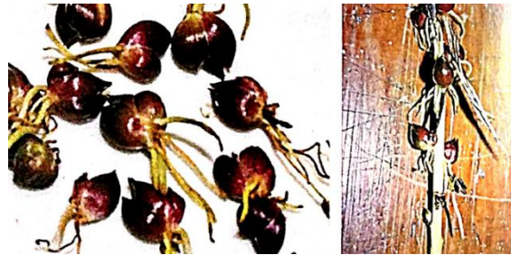
Fig . 1 showing stem detached bulbils (left) and bulbils attached with flowering axis (right)

Bulbils are aerial bulblets produced in the axils of leaves. They are usually dark purple to brown and 1-2 cm long. The capacity to produce bulbils varies with the species. Lilium tigrinum , L. bulbiferum , L. sulphureum and L. sargentae are easy to form bulbils. The production of bulbil can be encouraged by disbudding. The bulbils are harvested after flowering is over. They may have dormancy and planted in late summer.