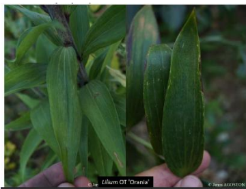
Lily symptomless virus – LSV

Control: use virus-free tissue culture batches or certified batches with a very low disease, spray against vectors according to current advice.