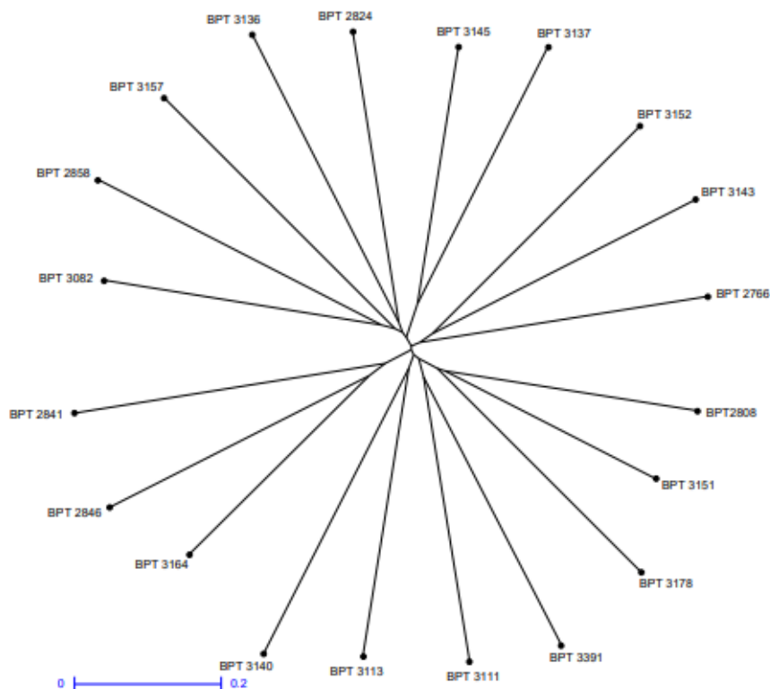
Fig. 2 Dendrogram of 20 rice genotypes based on molecular diversity