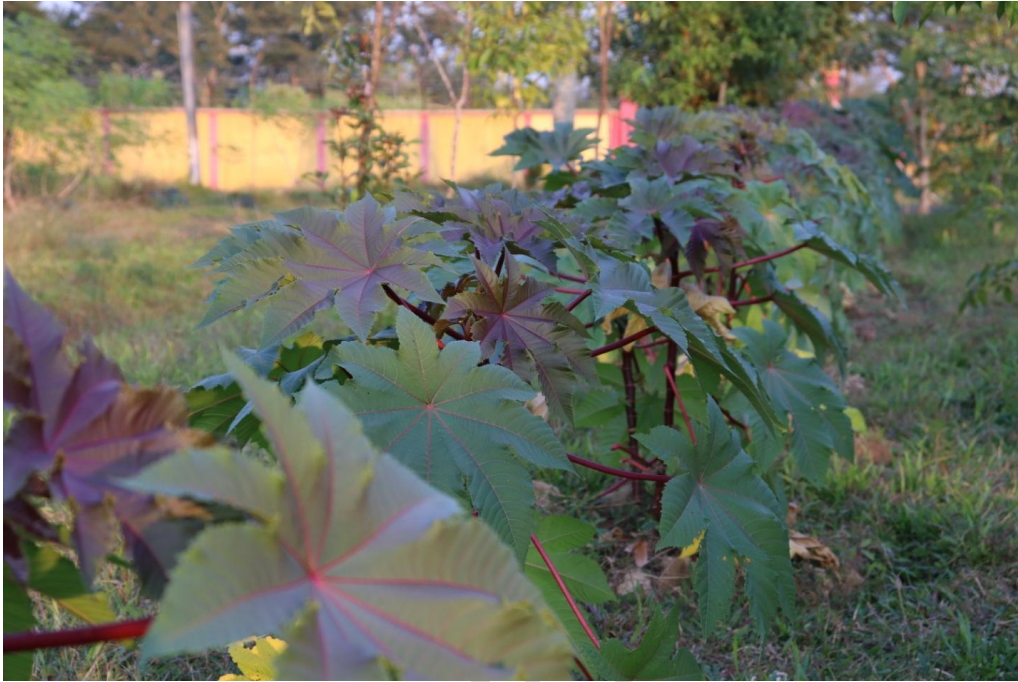
Figure 1. Castor cultivation at Germplasm Conservation Centre, Chenijan, Central Muga Eri Research and Training Institute (CMER&TI), Lahdoigarh