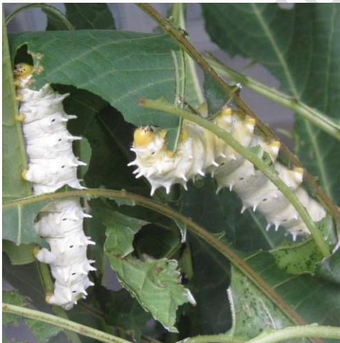
Figure 4. Eri silkworm ( Samia ricini Donovan) feeding on castor leaves