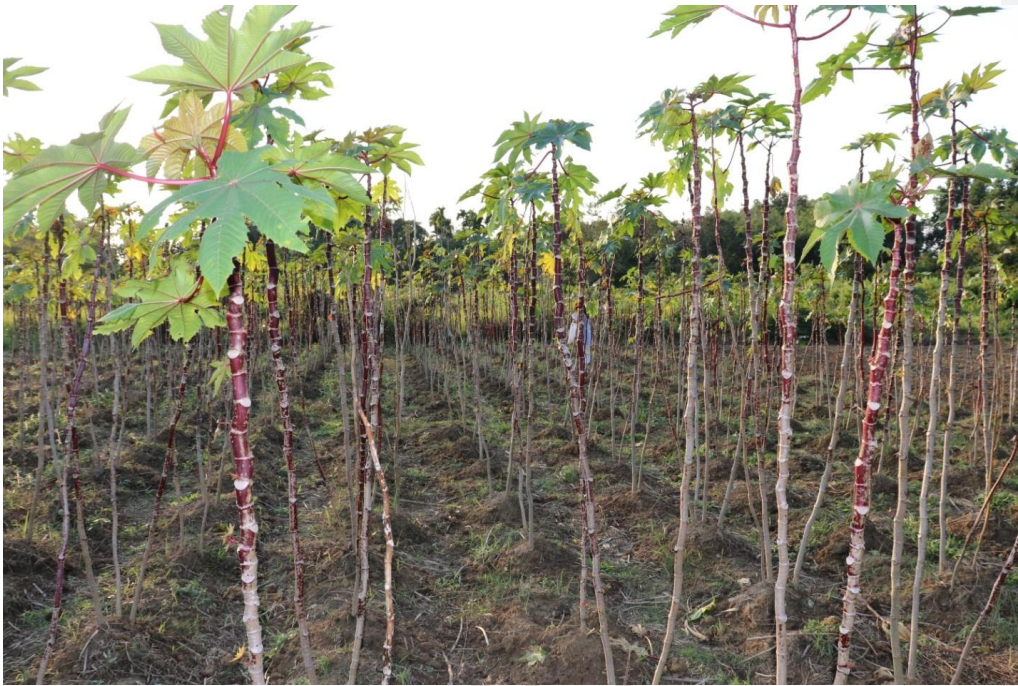
Figure 3 Infected castor fields