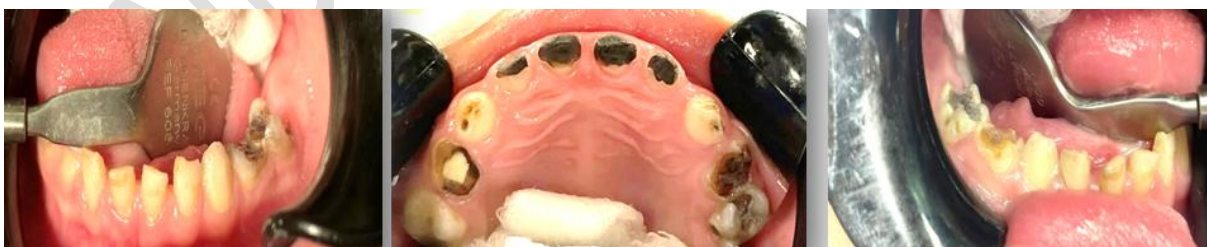
Figure 2: Intraoral examination showing generalized gingivitis with multiple caries.

The clinical and radiological intraoral examinations showed primary dentition status with multiple caries, generalized gingivitis, dental abrasion due to bruxism, and Class II malocclusion (Figures 2 and 3).