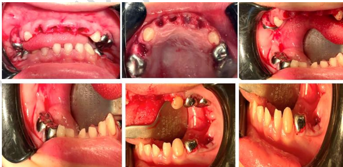
Figure 4: Postoperative intraoral photos showcasing the outcome of the treatment process.

Based on the findings, the treatment plan included extraction of the upper right first molar, the four upper anterior teeth, and the lower left second molar due to extensive decay. Additionally, pulpotomy and stainless-steel crowns were planned for the upper right second molar, the upper left first and second molars, the lower left second molar, and the lower right first and second molars due to severe decay with pulp exposure. Composite restorations were performed on the upper left and right canines, as well as the lower anterior teeth, where caries were present. Figures 4 and 5 display postoperative intraoral photos and radiographs showcasing the outcome of the treatment process.