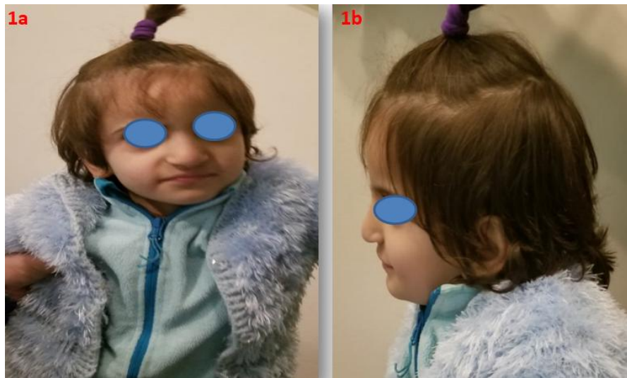
Figure 1: The patient's extraoral clinical examination highlighted facial features associated with epilepsy and CP. (a) Frontal showing facial asymmetry, and (b) lateral extraoral photographs showing no facial swelling, no palpable lymph nodes, and a normal facial profile (Class I profile).

Extraoral clinical examination showed facial asymmetry (Figure 1a), no facial swelling, no palpable lymph nodes, and a normal facial profile (Class I profile) (Figure 1b).