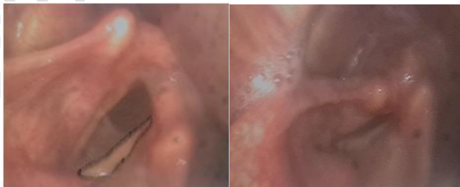
Figure 1. Videostroboscopic images showing left vocal cord paralysis

A 56-year-old male presented to our department with a four-month history of progressive hoarseness and dysphonia and dyspnea on exertion. He denied any respiratory symptoms, chest pain or dysphagia. He did not suffer any weight loss or fever. The patient was a 40-pack-year tobacco smoker with no evidence of pre-existing structural heart abnormalities or other medical conditions identified. Physical examination revealed left vocal cord paralysis in the paramedian position on flexible laryngoscopy (Figure 1), prompting further investigation. The macroscopic aspect of the vocal cords was normal. No cervical lymph nodes were palpable and the thyroid gland was not enlarged. The rest of the otolaryngologic exam was normal.