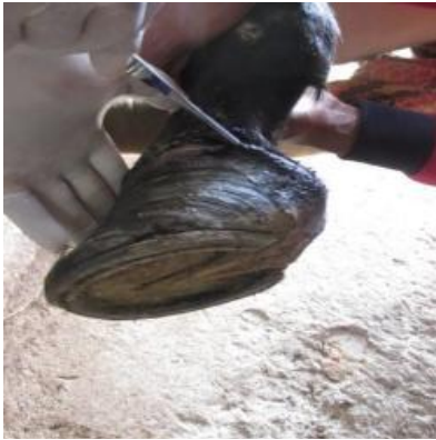
Fig 1L: Quittor