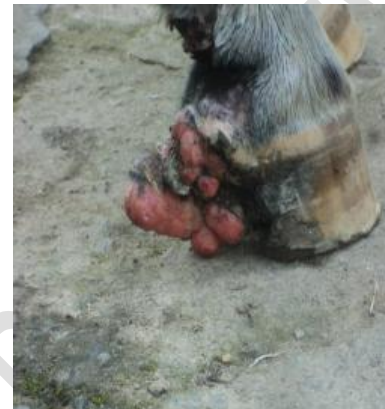
Fig 1L: Bulb fibroma