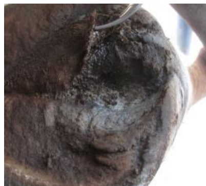
Fig 1H: Suppurative sole