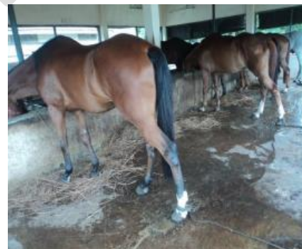
Fig 1L: Concrete floor