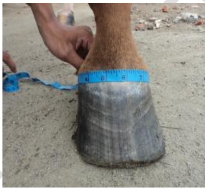
Fig 1D: Measuring of coronary band