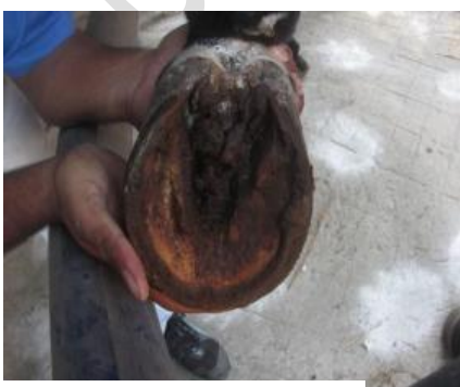
Fig 1G: Thrush