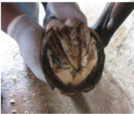
Fig 1E: Hoof overgrowth