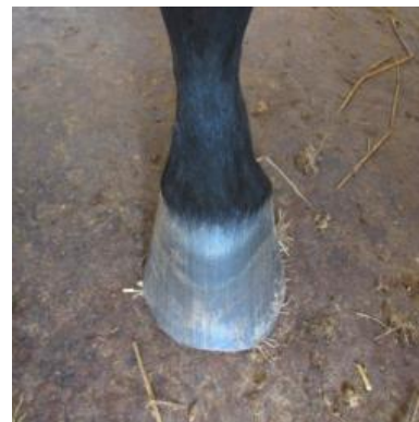
Fig 1J: Laminitis showing circular rings on hoof wall