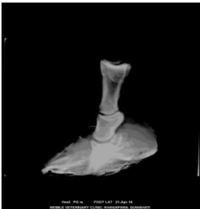
Fig 1K: Laminitis (3rd phalanx rotation)