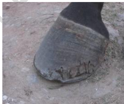
Fig 1F: Hoof wall crack