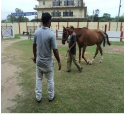
Fig 1A: Lame horse subjected to walk