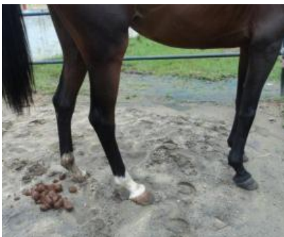
Fig 1M: Sand floor