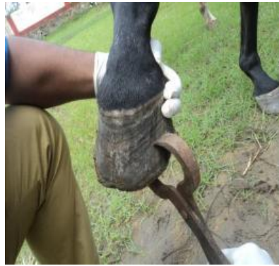
Fig 1B: Application of hoof tester