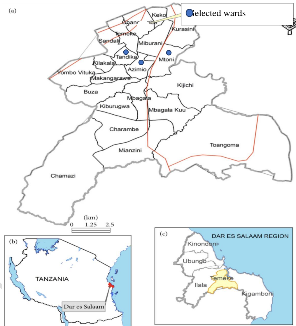
Figure 1: Map of Temeke Municipality showing selected wards

medium-low-income residents with inadequate sanitation (Kihupiet al. , 2016; URT, 2019). Additionally, a large percentage of inhabitants have little awareness of issues concerning water use, sanitation, and hygiene, as demonstrated by multiple studies (Chagguet al. , 2002; Kasalaet al. , 2016; Kihupiet al. , 2016; URT, 2019).