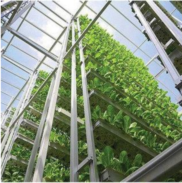
Figure 2 shows the rotating tower system used by Sky Greens.