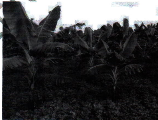
Cover plants in a banana plantation