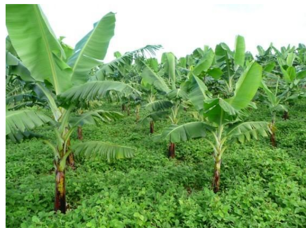
Rubber hedge Cover plants in a banana plantation