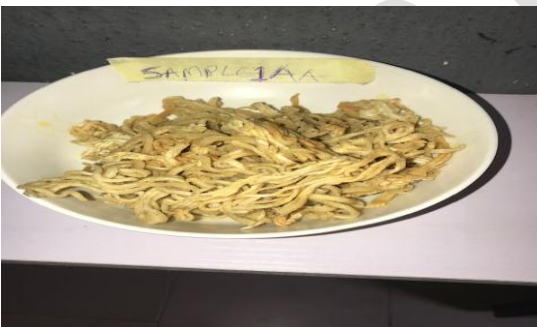
Plate 3: WFO (100 % wheat and 0% Azelia africana (Akparata) flour)