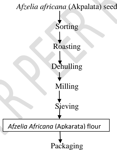
Figure 1: Processing of Afzelia africana (Apkalata) flour

Figure 1 depicts the flour's production.