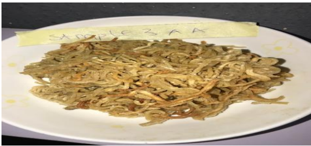
Plate 5: WFAF 2 (90% wheat and 10% Afzelia africana (Akparata) flour.

Functional Properties of Flour Blends: The functional properties of flour blends of wheat and Afzelia africana (Akparata) flour are as shown in Table 1.