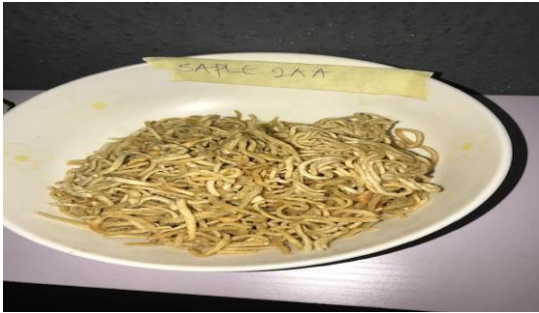
Plate 4: WFAF 1 (95 % wheat and 5% Afzelia africana (Akparata) flour