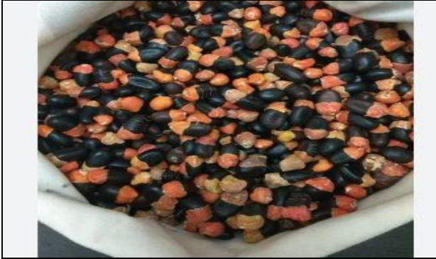
Plate 1: Azelia africana (Akparata) seed