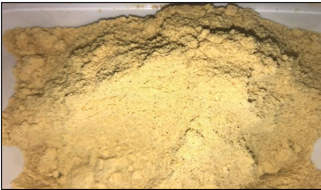
Plate 2: Azelia africana (Akparata) flour