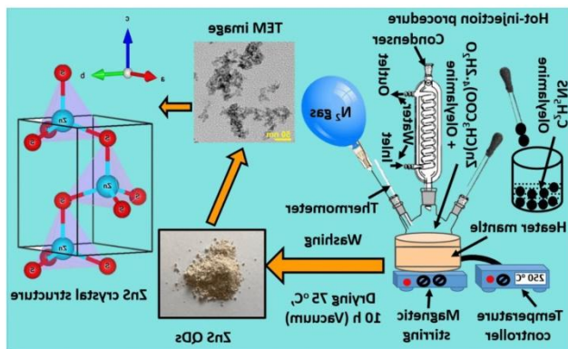
Figure 4: Schematic representation of a quantum dot-based sensor for soil health monitoring.

2.4 Quantum dots (QDs) Quantum dots (QDs) are semiconductor nanocrystals with sizes ranging from 2 to 10 nm [24]. QDs exhibit unique optical and electronic properties, such as size-dependent emission wavelength, broad absorption spectra, and high quantum yield [25]. QD-based sensors exploit the changes in fluorescence or photoluminescence when the QDs interact with target analytes [26]. The tunable emission wavelength, photostability, and high sensitivity of QDs enable multiplexed detection of soil health parameters, such as heavy metals, pesticides, and nutrients [27].