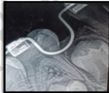
Fig 6. POST-OPERATIVE