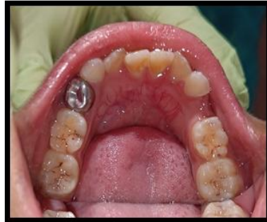
Fig 5. PRE-OPERATIVE

Thus, this new space maintainer is found to be very easy to place, comfortable, cost and time effective appliance that can be a viable alternative to the conventional band and loop space maintainer.