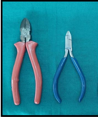
Fig 1. ARMAMENTARIUM