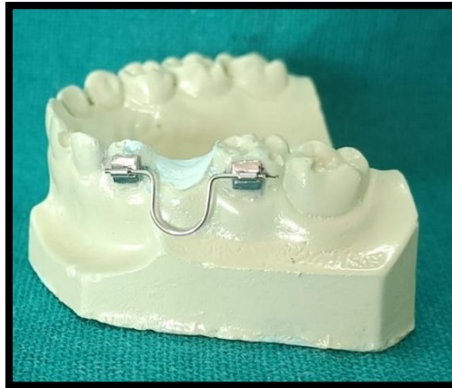
Fig 4. SONAL'S 'U' BONDED SPACE MAINTAINER