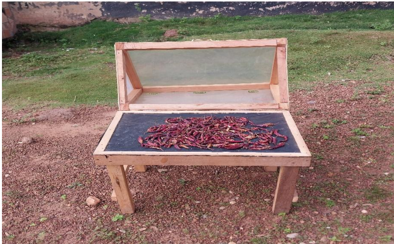
Figure 2. Solar dryer

Blanched chili peppers were dried from 8:00 am to 6:00 pm for two (2) weeks but unblanched chili peppers were dried for three (3) weeks. After drying of chili pepper fruits, the fruit stalks were removed or destalked.