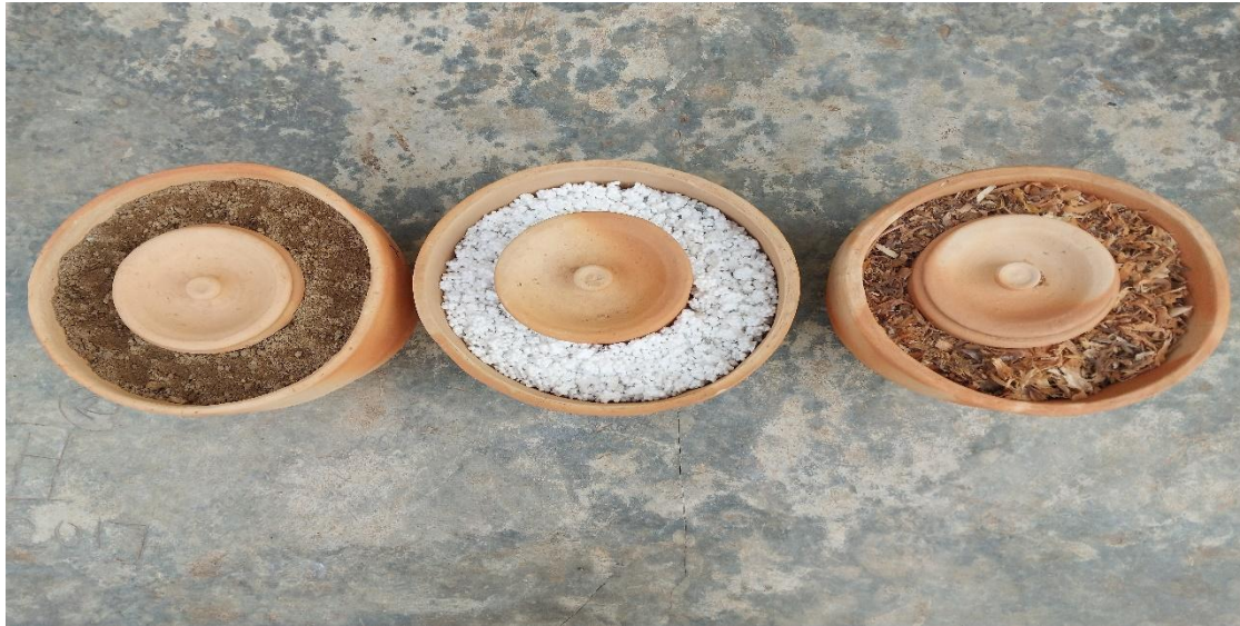
Figure 3. Zeer pot refrigerators with different lining media