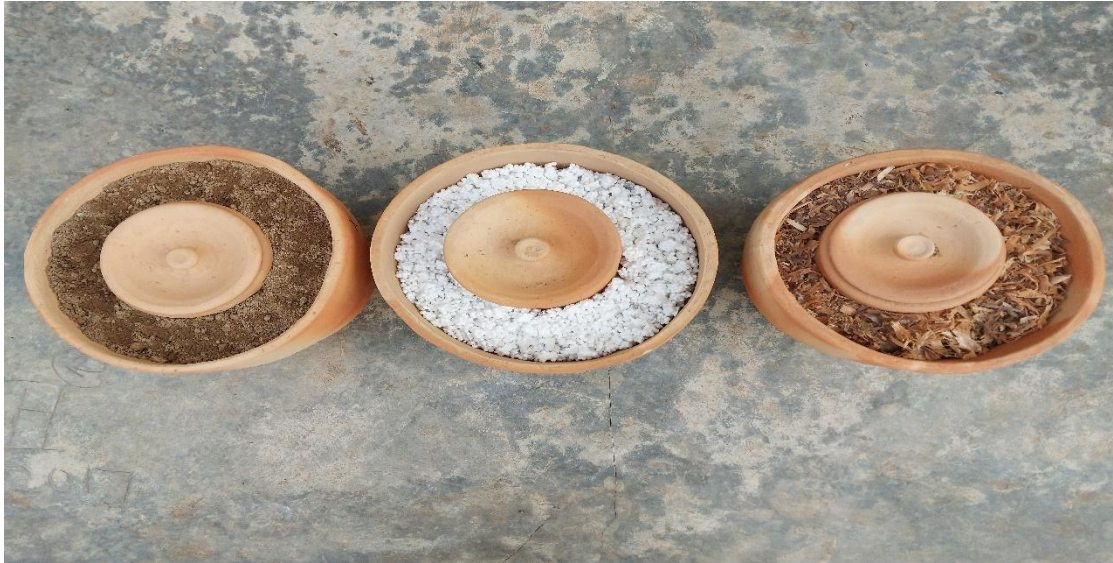
Figure 3. Zeer pot refrigerators with different lining media