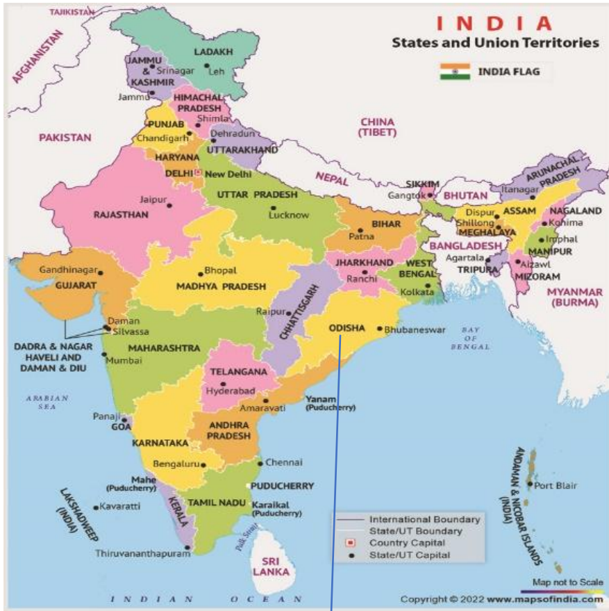
A. Inida Map.