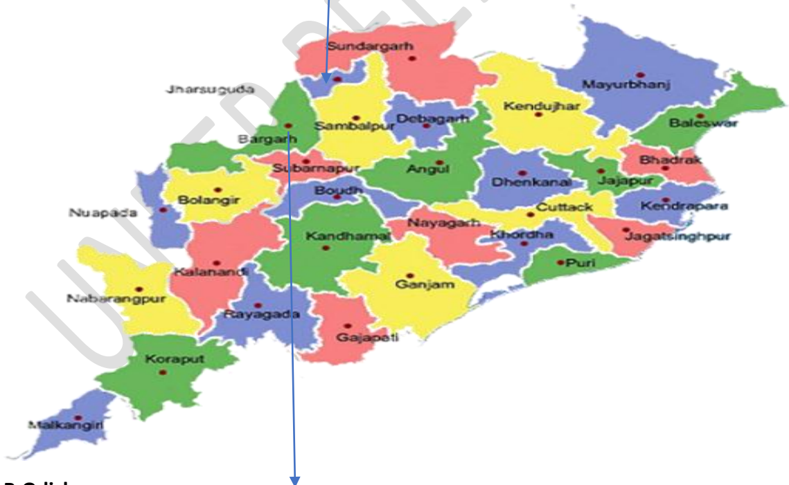
B. Odisha map